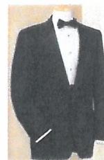
Classic Notch Lapel Black Tuxedo Jacket